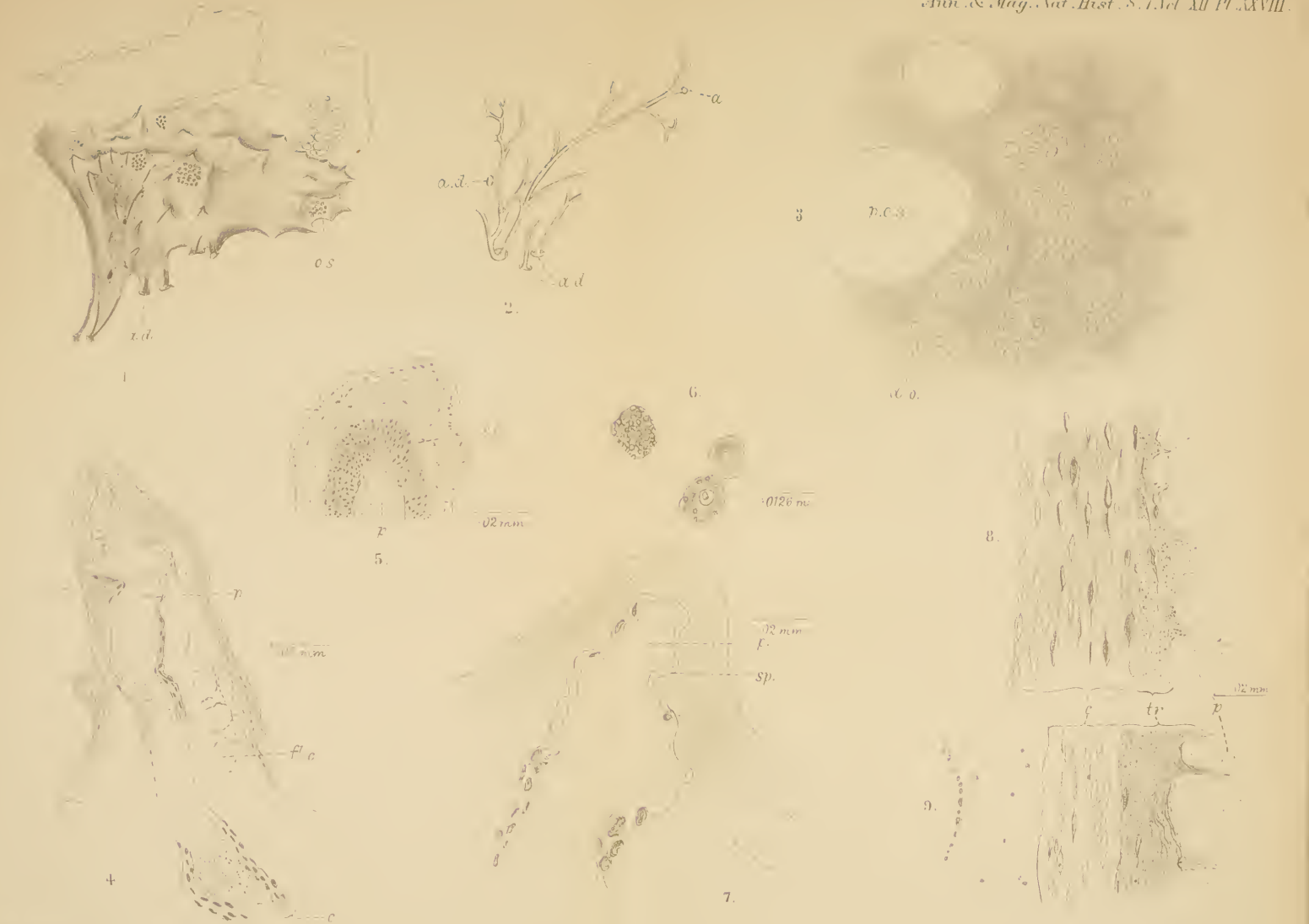
Ann & Mag. Nat Hist . S. 7. Vel XII 19 .XXVIII.