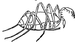
Erebomaster flavescens , magnified 7.6 times.*