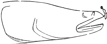
Cauloxenus stygius in position on the lip of Amblyopsis spelæus , enlarged.

of the cephalothorax being between the lips of the fish. This position being retained, it becomes a favorable one for the sustenance of the parasite, which is not a sucker or devourer of its host, but must feed on the substances which are caught by the blind fish, and crushed between its teeth. The fragments and juices expressed into the water must suffice for the small wants of this crustacean.