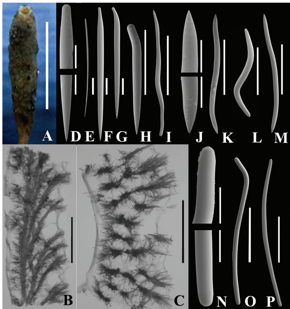
Figure 1. Auletta krautteri sp. n. A Fresh specimen, KML1107, KML Sta. 171/76, West of Flamingo Inlet, BC, scale bar 5 cm B KML1105, vertical longitudinal section, scale bar 3 mm C KML1105, cross section, scale bar 3 mm; D–O. KML1105, spicules D ends of style, scale bar 50 µm E style associated with osculum (under light microscope), scale bar 100 µm F–I various forms of styles F scale bar 100 µm; G. scale bar 100 µm H scale bar 200 µm I scale bar 300 µm J ends of oxea, scale bar 50 µm K–M various forms of oxeas K scale bar 300 µm L scale bar 200 µm M scale bar 300 µm N ends of strongyle, scale bar 50 µm O, P two forms of strongyles, scale bar 300 µm.

cavity extending the length of the tube and into the stalk where the tube diameter is restricted. Wall thickness of the tube 5–10 mm. Surface felt-like to touch. Smooth inner wall penetrated by a series of elongate openings. Consistency compressible but firm and tough. Colour in life reddish-brown; grey or cream in alcohol. Specimens collected in 1965 contained oocytes 130 to 150 µm diameter.