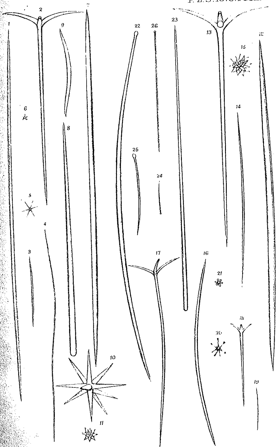
Pachymatisma inconspicua 1-6. P. contorta 7-11. Geodia parasitica 12-15. G. paupera 16-21. Tethea hispida 22-26.