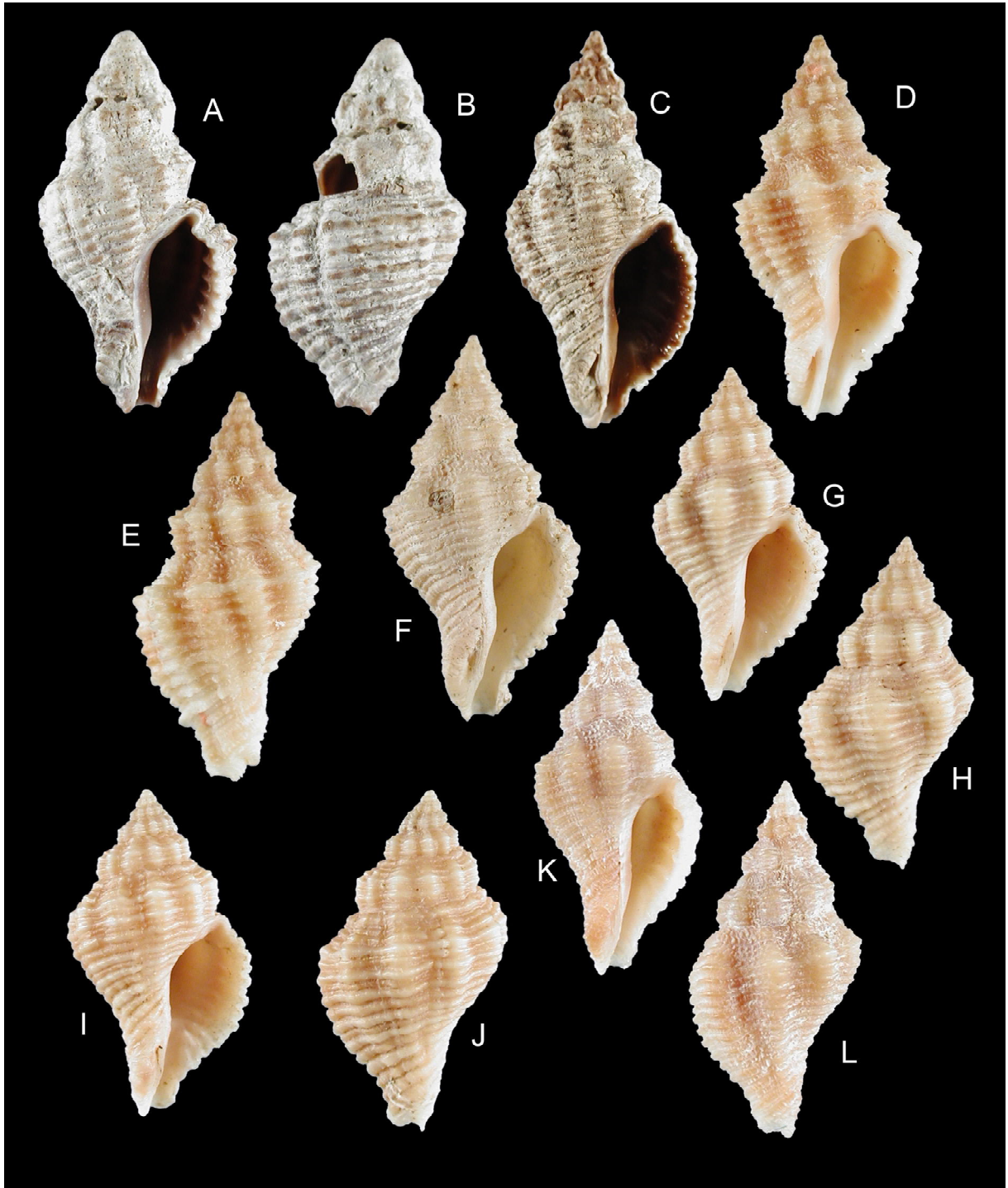
FIG. 4. Bedevina birileffi (Lischke, 1871). A-B – Japan, Kagoshima Prefecture (radula illustrated Fig. 3 F), 18.5 mm (RH); C – Japan, Mukaishima, 23.1 mm (RH); D-E – Japan, Kusui, Nada-Cho, Wakayama Prefecture, 20.5 mm (RH); F – Sumatra, near Tanjung Pinang, in approximately 36 m, 19.7 mm (RH); G-J – W Borneo, Tanjung Batu, 46 m (RH) G-H – 16.3 mm, I-J – 14.6 mm; K-L – Near Belintung Isю, Carima Straits, 15-20 m, 14.8 mm (protoconch illustrated Fig. 3 D) (RH).

РИС.4 Bedevina birileffi (Lischke, 1871). А-В – Япония, префектура Кагосима (радула изображена на Рис. 3 F), 18.5 мм (RH); С – Япония, Мукаисима, 23.1 мм (RH); D-E – Япония, Кюсю, Нада-Чо, префектура Вакаяма, 20.5 мм (RH); F – Суматра, вблизи Таньунг Пинанг, на глубине около 36 м, 19.7 мм (RH); G-J – Запад Борнео, Таньунг Бату, 46 м (RH) G-H – 16.3 мм, I-J – 14.6 мм; K-L – Вблизи о-ва Белинтунг, пролив Карима, 15-20 м, 14.8 мм (протоконх изображен на Рис. 3 D) (RH).