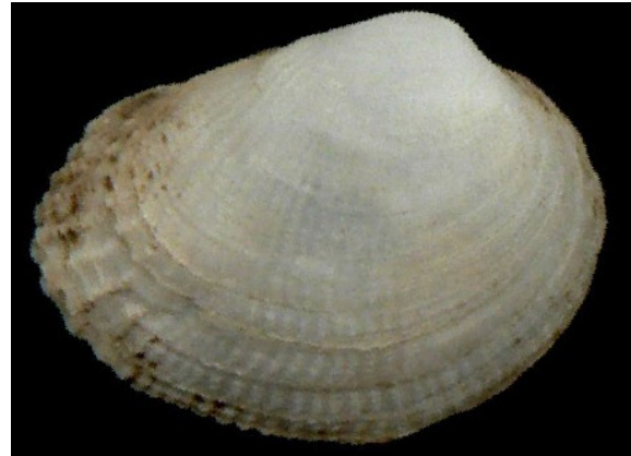
Figure 4. Petricola hemprichi , outside of right valve

Material: Eleven specimens were found in holes on the shells of Spondylus spinosus from 7 m depth at Karatas (36°34'12" N, 35°34'30" E) on 11 August 1999.