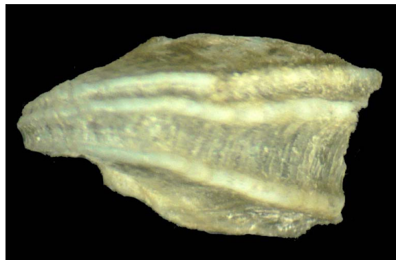
Figure 2. Amathina tricarinata , view from dorsal

Material: Seven specimens were found under the spines of the bivalve Spondylus spinosus Schreibers, 1793 from 25 m depth at Yumurtalık (36°46'17" N, 35°49'57" E) on 12 January 2000.