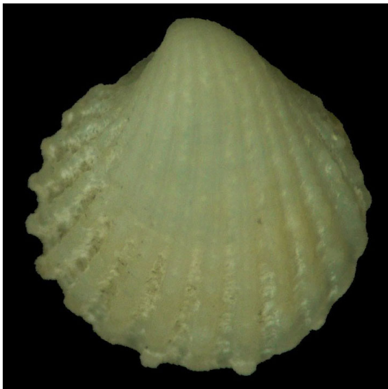
Figure 3. Cardites akabana , outside of left valve

Material: Three specimens were found on muddy-sand bottom from 10 m depth at Dortyol (36°53'50" N, 36°04'34" E) and Kale (36°19'31" N, 35°46'49" E) on 11 November 2005.