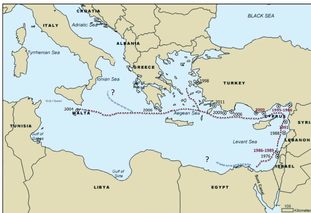
Figure 3. Hypothesized expansion route taken by Rhopilema nomadica throughout the Mediterranean Sea to date. Key: red years, records of outbreaks; black years: records of few individuals. Supporting information to the records reported in this figure is given in Table 1.

study may not necessarily contradict such a hypothesis as drifting jellyfish may reach the entrance to Western Mediterranean, but the full completion of the R. nomadica life cycle may be prevented by the low winter temperatures affecting scyphistoma or podocyst stages survival.