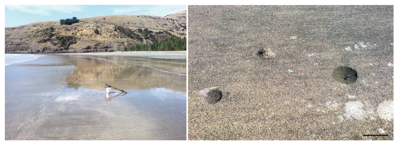
FIGURE 4 . A, Okains Bay beach type locality, with sampling equipment in foreground; B, cast and stopings of Clymenura snaiko sp. nov. , Okains Bay beach. Scale bar 20 mm.

Cly. snaiko sp. nov. may be subject to 'browsing' attacks from predators such as shorebirds and fish. A large Disconatis accolus (Estcourt) polynoid scaleworm (NIWA lot 44782) was found as a commensal in the tube of the specimen from station Y10432 in Decanter Bay.