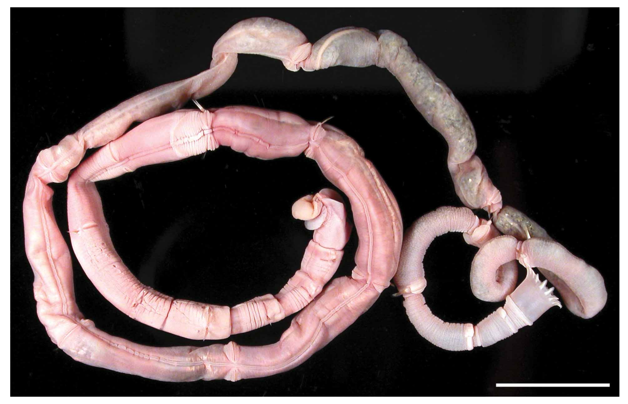
FIGURE 1. Clymenura snaiko sp. nov. Holotype. Scale bar 10 mm.