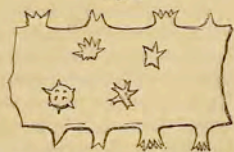
Diagram of spinous processes on the vitreous fibre of Dendrospongia , on the scale of \frac{1}{12} to \frac{1}{8000} inch. After Carter.