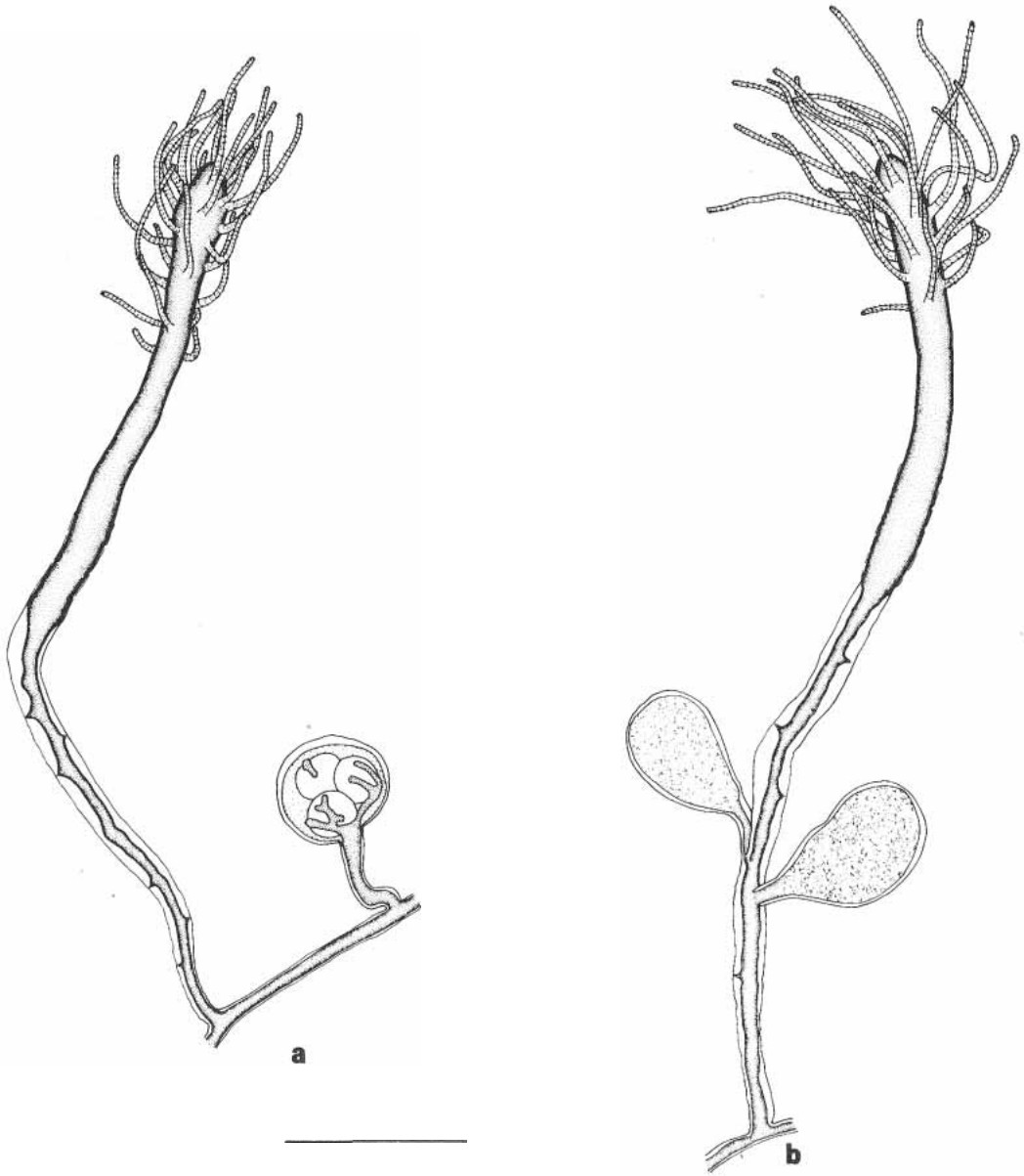
Fig. 1. Turritopsoides brehmeri , n. gen., n. sp.: a, Holotype, with female gonophore, ROMIZ B390; b, Paratype, with male gonophores, ROMIZ B391. Scale line equals 1 mm.

Description. —Colonies stolonial, or infrequently with a branch arising from the primary pedicel; arising from a creeping, reticular hydrorhiza. When present, branch adnate to pedicel for a short distance at origin, curved outwards and becoming free distally. Pedicels short, up to 4 mm high