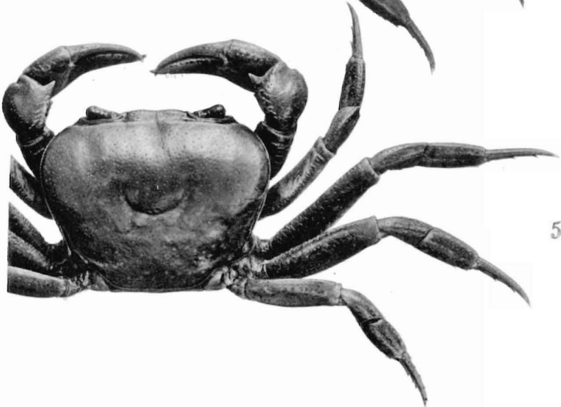
RIVER-CRABS FROM SIAM AND ANNAM.